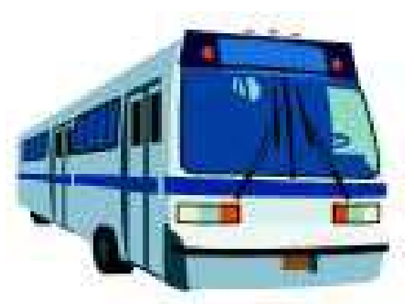
Franklin County Department of Job and Family Services

BUS PASSES for Medical Transportation Services